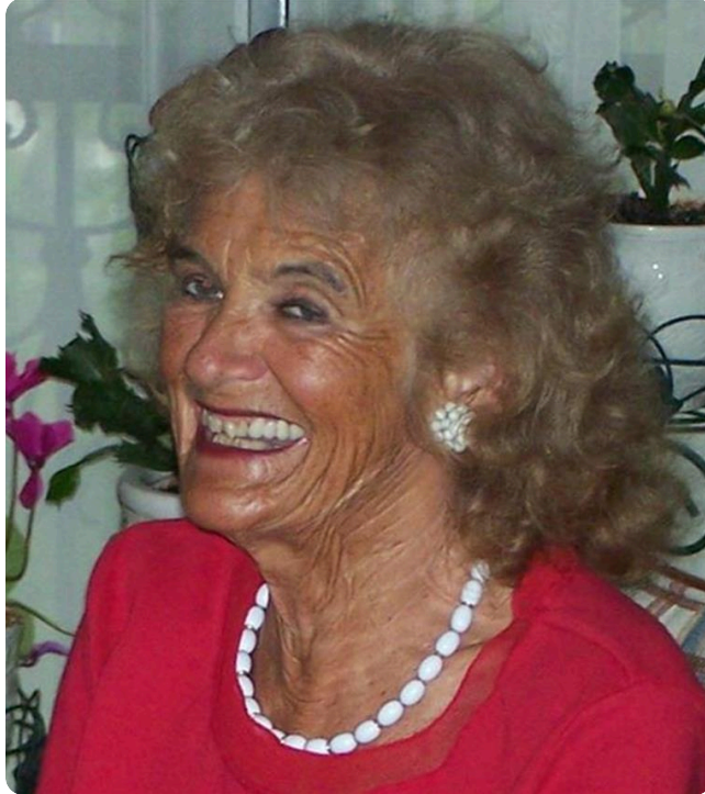
Smile for the camera!